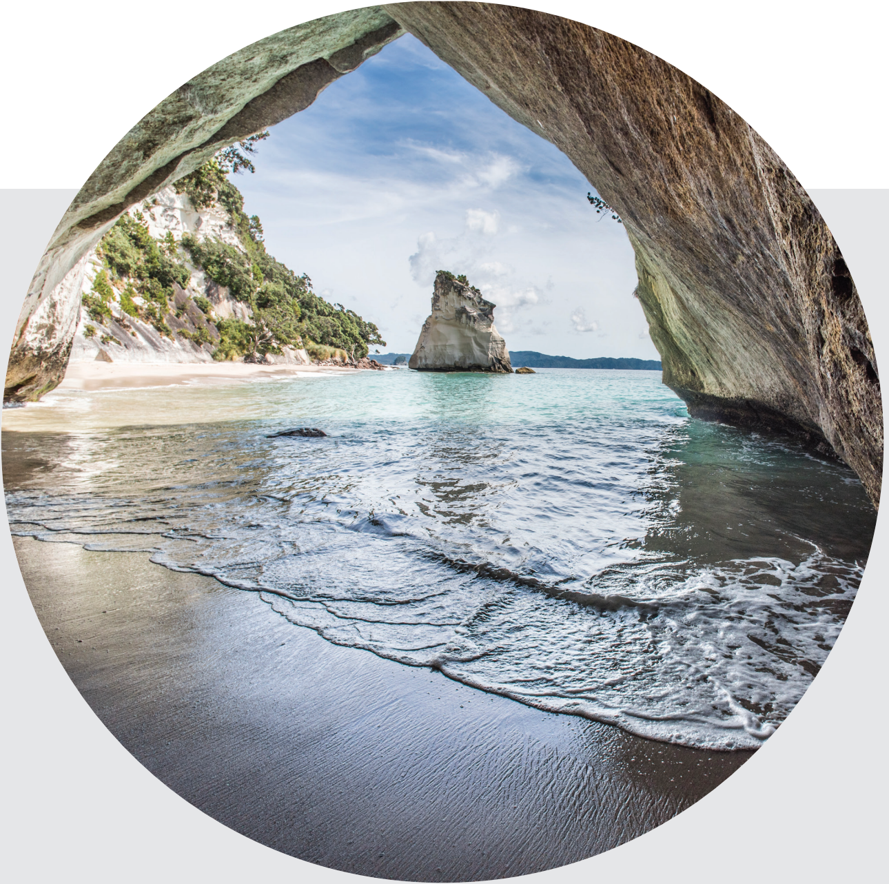
Cathedral Cove Coromandel Peninsula