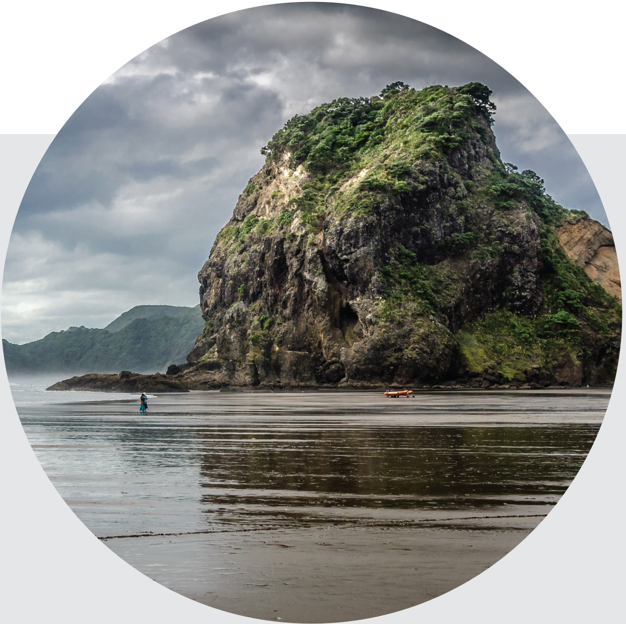
Lion Rock, Piha Beach Auckland