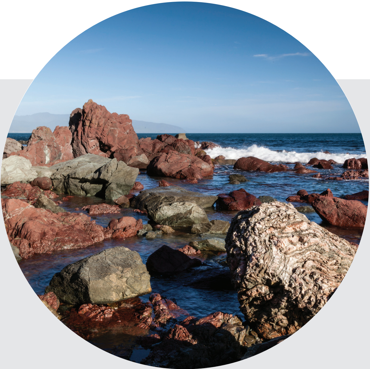
Red Rocks Wellington