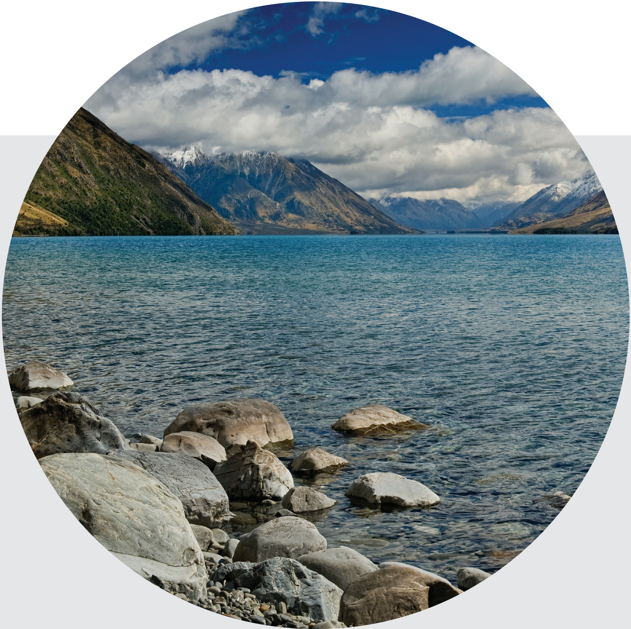
Lake Coleridge Canterbury