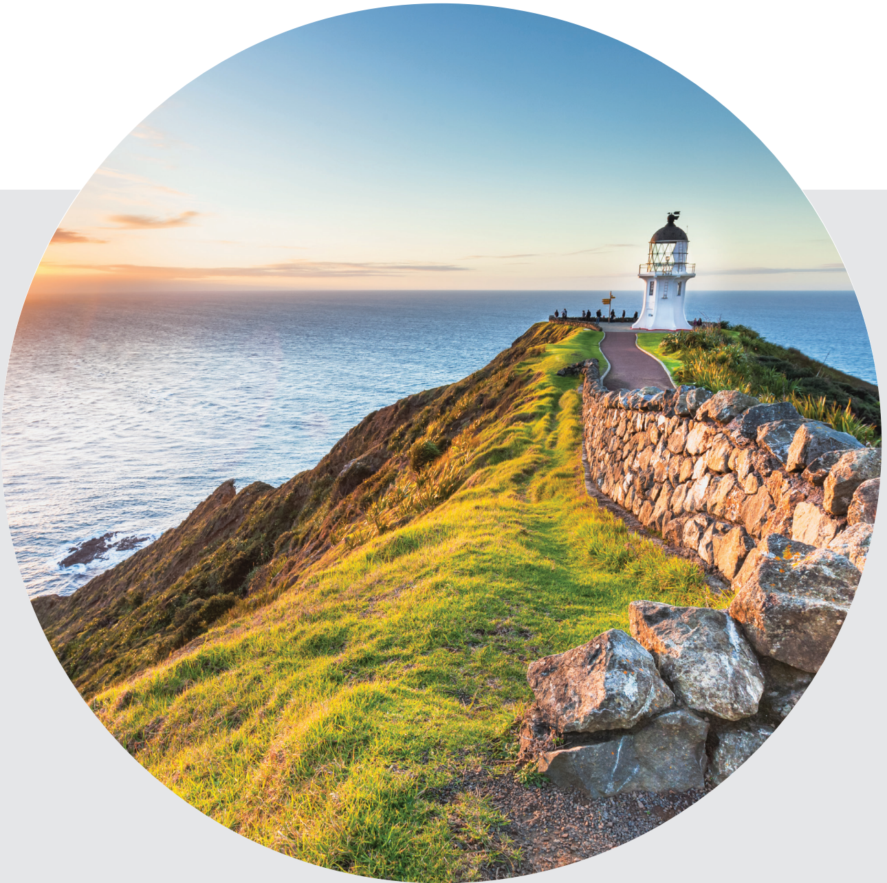
Cape Reinga Lighthouse Northland